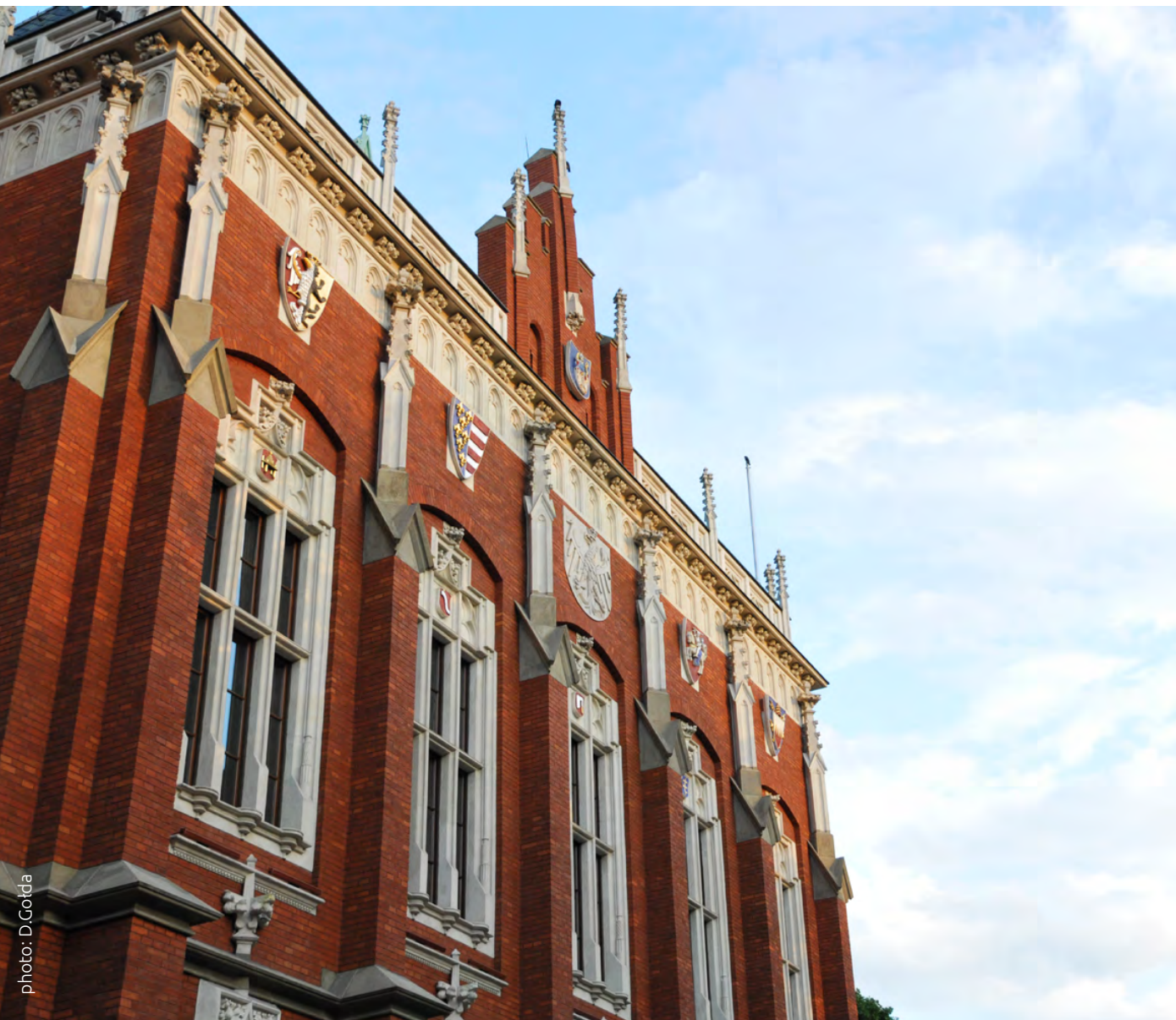
Main building of the Jagiellonian University in Kraków, built in 1873-1887.